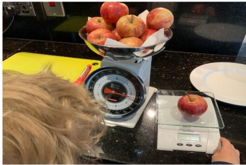
Weighing apples: We were comparing the different scales. Have you got scales at home? What could you weigh?