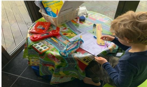
Well Being: Can you think of something that makes you feel proud?