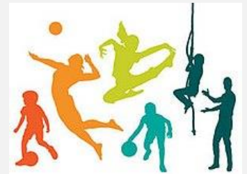
PE with Joe Wicks