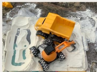
Playing with construction vehicles. Has it snowed or is it talc?