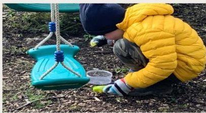
Living things: Hunting for insects 🐛