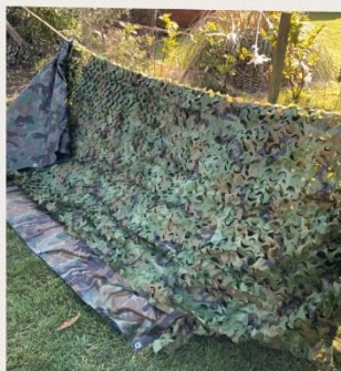
Day 3: Home schooling at Mrs Barker's House 25.03.20