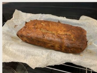
The banana bread was delicious. We did save some and put it in the freezer.