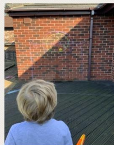
We made a target board on the wall, using chalk. We all practised our tennis and multiplication, using the numbers on the target.