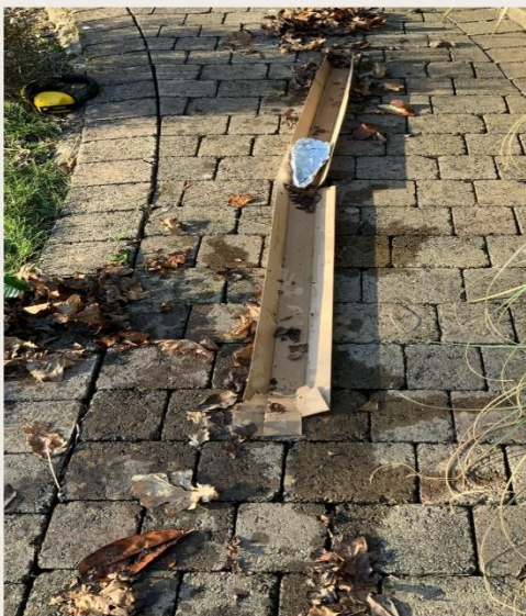
Testing materials: Making a canal using cardboard. Oh dear, it was too absorbent! The tinfoil boat didn't get very far 😞