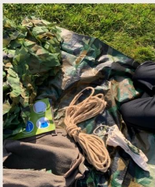
Following instructions: Make a den. He is now charging for guided tours! 5 tours for 10p! How much would 1 tour cost?