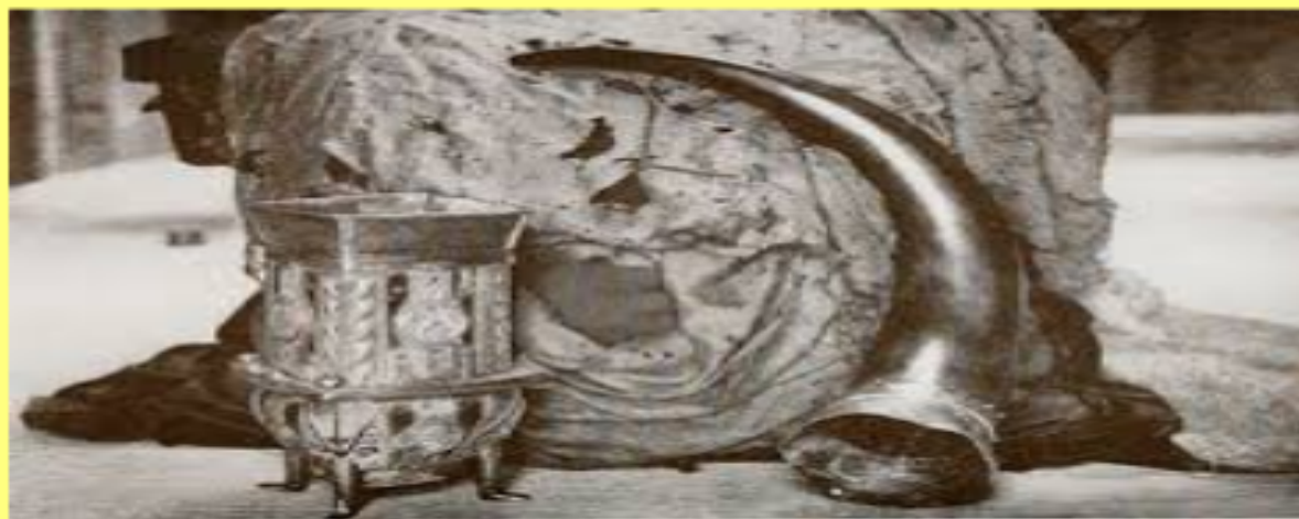
The Fairy Flag of the MacLeod