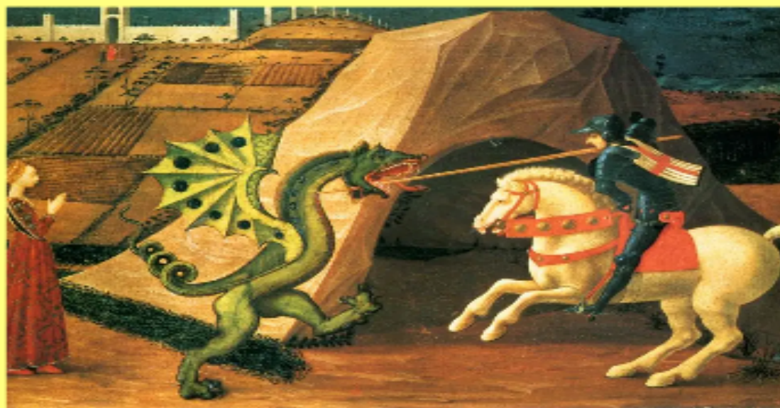
George and the Dragon