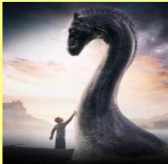
The Water Horse