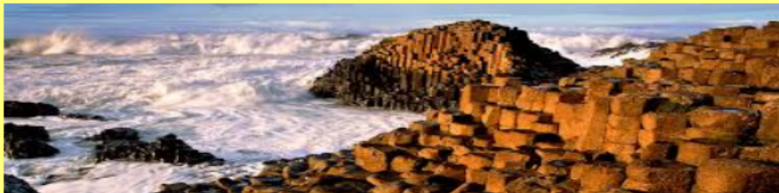
Finn MacCool and the Giant's Causeway