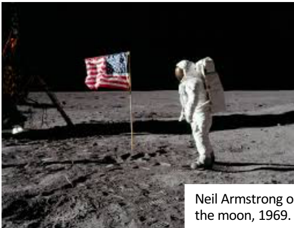
Neil Armstrong on the moon, 1969.