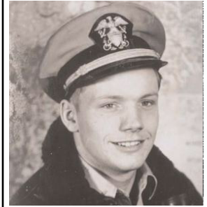
Neil Armstrong as a pilot before joining NASA.

Born in 1930, in the state of Ohio in the United States of America, Neil Armstrong worked hard to achieve his dream. He was only 15 years old when he received his pilot license and by the time he had left university, he had flown over 200 different aircrafts! In September 1962, he was accepted to NASA's astronaut corps, where he knew he might one day go in to space.