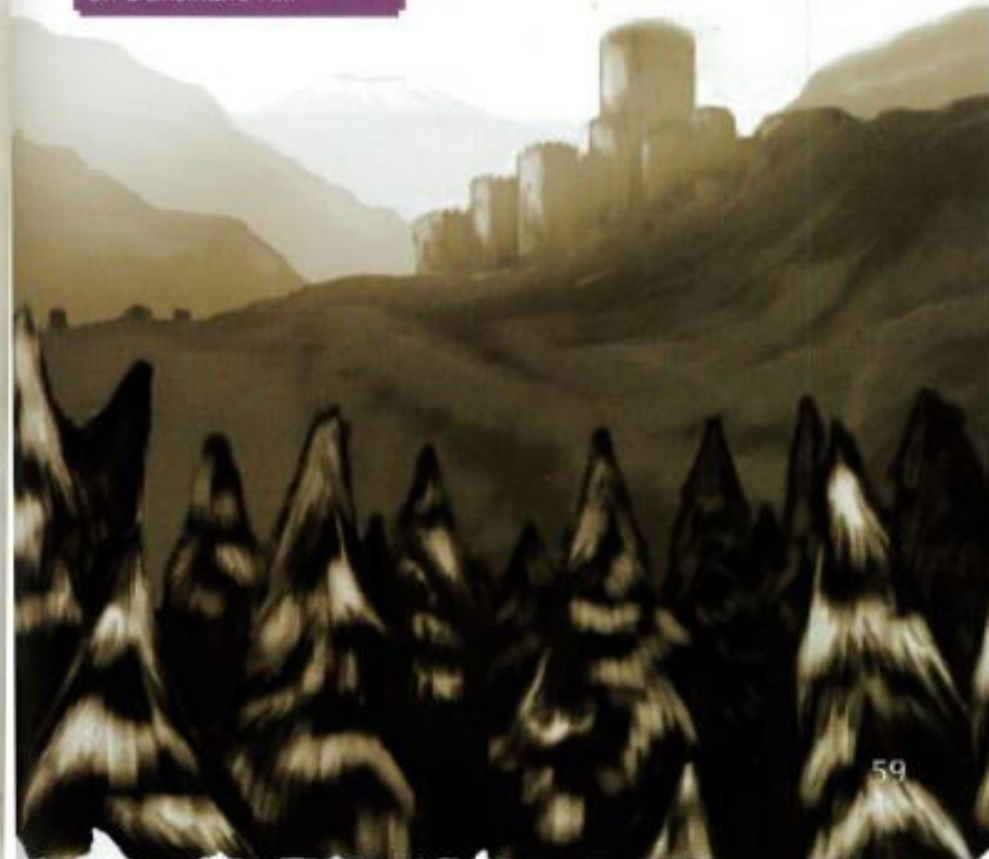
Birnam Wood advancing on Dunsinane Hill

The English soldiers cut off branches from Birnam Wood and advance with them as a shield: the wood itself seems to be moving. Macbeth realises that the witches have tricked him, and that it's all over. He's killed in battle by Macduff. He has been tricked by the witches, but it's his own ambition and greed which have really led to his downfall.