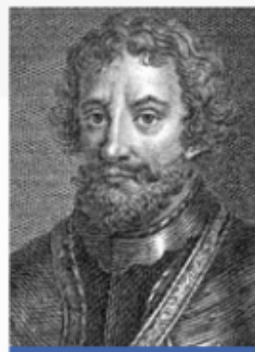
Macbeth, c.1040

Mac Bethad mac Findláich, known in English as Macbeth, was born in around 1005. His father was Finlay, Mormaer of Moray, and his mother may have been Donada, second daughter of Malcolm II. A 'mormaer' was literally a high steward of one of the ancient Celtic provinces of Scotland, but in Latin documents the word is usually translated as 'comes', which means earl.