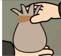
Judas betrays Jesus