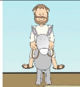
Jesus enters Jerusalem