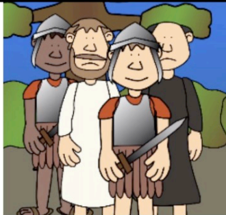
Jesus is arrested

Look at these pictures. They are events that took place in Holy Week. They are not in the correct order. Cut them out. Order the events correctly and then stick them in your book. Then, write a short sentence next to each picture.