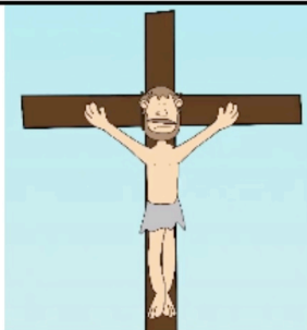
Jesus is crucified